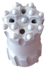
HTG 38CT64DSR HTG 45CT76DSR